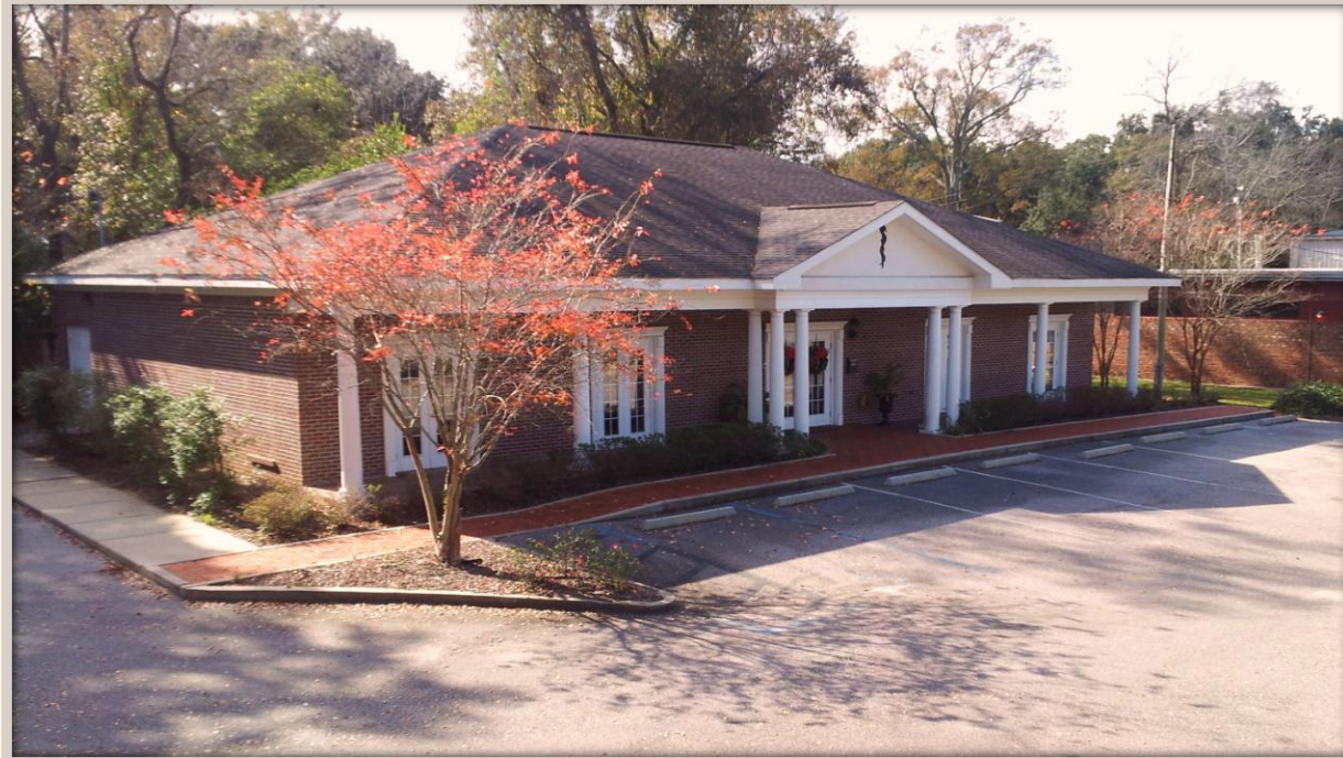
YOUR MEDICAL SOCIETY OF MOBILE COUNTY OFFICE AT 2701 AIRPORT BLVD