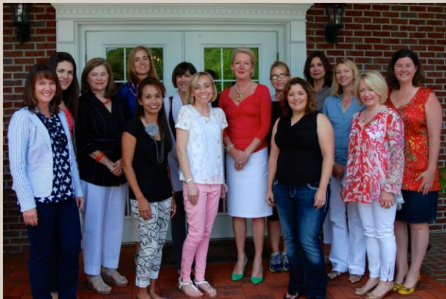
THE INSTALLATION OF THE 2013 ALLIANCE EXECUTIVE BOARD