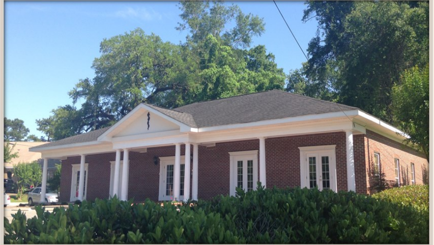
THE MEDICAL SOCIETY OF MOBILE COUNTY AT 2701 AIRPORT BLVD

As your Medical Society, we want to be what YOU need us to be. In the next few months, you will be given several opportunities to complete a short survey on Our society. Please take the time to give us your feedback so we can be the Society you need. Thank you for the outstanding service you provide to the citizens of Mobile. Lastly, next time you are in the neighborhood, stop by the office. We would love to show you around!