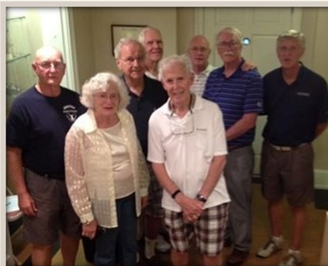
Board of Directors of the American Academy of Family Physicians