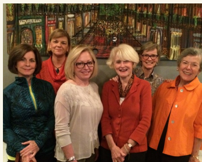
Pictured below is the Alliance Christmas Luncheon