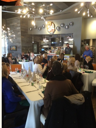
Pictured above is the new Alliance Platinum Club